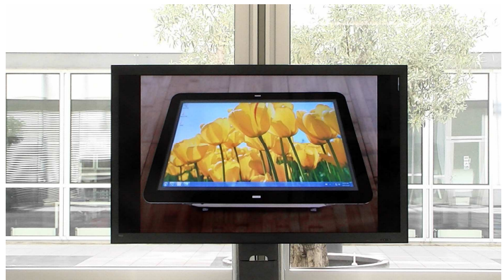
I-VOLUCE G Gesture Computing