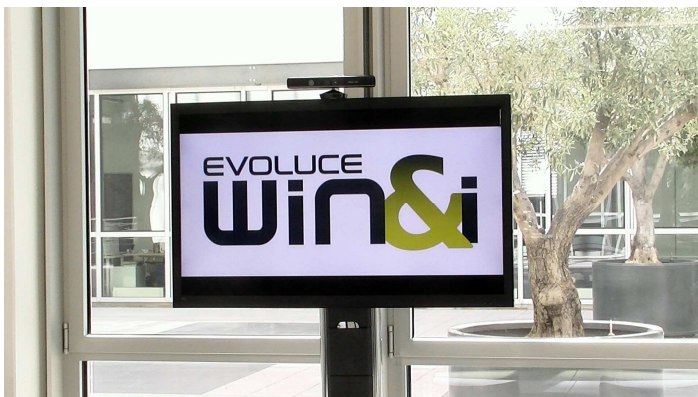
I-VOLUCE MG Multi-touch & Gesture Computing